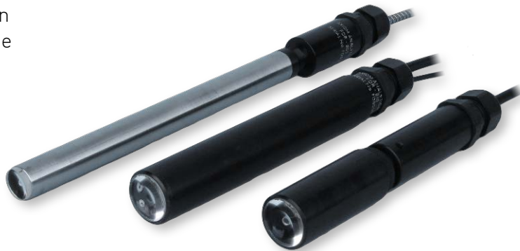
FDR-803, 805, and 810 Diffuse reflectance probes

FDR-800 Series diffuse reflectance probes have been designed to provide optimum performance in the non-contact analysis of powders and other diffusely reflecting materials. The series includes three models.